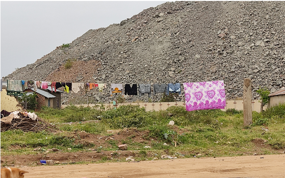
Local people say that dust from the mine’s operations permeates residential areas

RAID asked Barrick if it was aware of any police officers being disciplined or prosecuted for unlawful conduct, but Barrick did not respond.