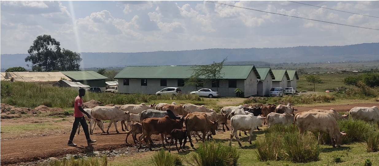
A man herds cows past barracks provided to the police by the North Mara gold mine

He said that the matter had been reported to the local police, who in turn had called “the leader of the police who guard the mine”, but they had directed local residents to speak with village leaders to organise a meeting with the mine. He said that residents had reported the issue to the village leadership, but, as in the past, “nothing happens”.