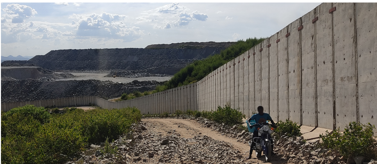
Riding along the mine wall from Kwimange to Nyangoto, North Mara, Tanzania

In September 2020, Barrick announced it had replaced the international security firm providing security at the mine, which was G4S, with a Tanzanian private security contractor, Nguvu Moja. RAID was told that other security personnel were also replaced. After appointing Nguvu Moja, Barrick announced that it had “substantially reduced” the risk of excessive force being used by private contractors at its mine sites by removing “all weapons”, and later confirmed to RAID in writing that Nguvu Moja personnel are unarmed. Members of the mine security team raised concerns about the professional conduct of the Nguvu Moja guards soon after the appointment. In documents seen by RAID, the security team raised concerns up the chain indicating that Nguvu Moja personnel were unprepared and insufficiently experienced for the security tasks they had been assigned. According to RAID’s information the problem persists.