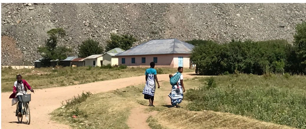
Daily life against the backdrop of waste rock at Barrick’s gold mine in North Mara