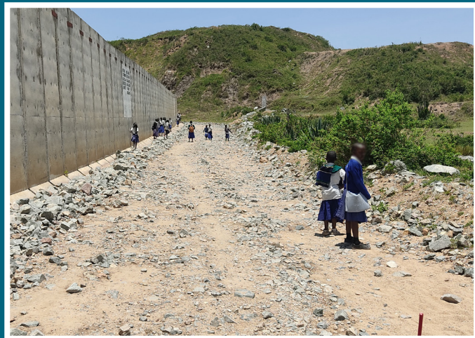
Children on the way to school by Barrick’s North Mara mine wall

Barrick subsidiaries are due in a British court on 17 March to face allegations of unlawful killings and assaults at the mine between 2014 and 2019. The claimants include the family of a nine-year-old girl killed by a mine vehicle driven by police, and four women who were fired upon while gathering around her body. Barrick’s subsidiaries deny liability.