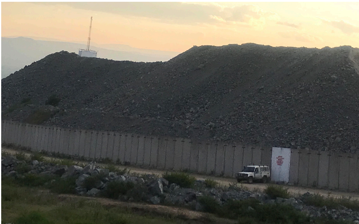
Mine vehicle used by police deployed at Barrick’s North Mara gold mine