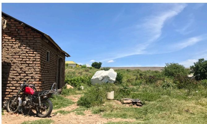
Stark white boulders placed by Barrick's North Mara mine mark the plots of those it has displaced

In its 2020 Annual Report to the Voluntary Principles on Security and Human Rights, a multi-stakeholder initiative of which Barrick is a member, Barrick stated that agreed policing under the mine's Memorandum of Understanding (MoU) with the Tanzania Police Force includes “areas around” the mine site. A 2016 letter to RAID from the mine also stated that the mine has 444 infrared cameras and 14 FLIR thermal cameras and “continually monitor[s] the security situation in and around the Mine”; it further said that the mine follows up on “any allegation of human rights involving Tanzanian police deployed on or around ” the mine (emphases added). It described the monitoring as “consistent with our commitment to the Voluntary Principles on Security and Human Rights”.