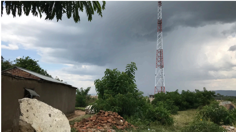
A mine surveillance tower looks over residential areas

RAID asked Barrick what measures it had to ensure local residents could express themselves freely should they be critical of the mine. Barrick said in its response to RAID that “grievants are encouraged to express themselves freely without fear of reprisals” and that it has a third-party ethics