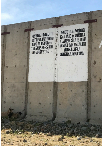
On a road by the mine wall, police assigned to the mine enforce a “curfew” on local residents

Under the mine’s agreement with the police, assigned officers are provided not just with accommodation, but daily payments, meals, vehicles and fuel from the mine. Former mine personnel and local leaders said that the mine also provides one or more senior officers in the region with fuel and vehicle maintenance, which is provided for police vehicles also used during assignments to the mine as well.