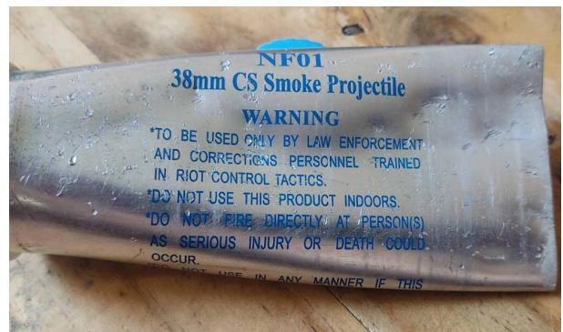
An empty teargas canister collected outside the mine wall near residential area

Local leaders told RAID that in previous years they had reported their concerns regarding police guarding the mine conducting operations in their communities and mistreating those using the road, but the mine had either not responded, or otherwise blamed the communities. One village chairperson said, "As local leaders, we wrote letters to the mine complaining about the bad behaviour by the police but the mine has neglected our letters and so we stopped writing [them]." Another hamlet chairperson told RAID that when the issue of mistreatment of those using the road had been raised with the mine on behalf his community, "the mine... said it was our fault for upsetting the police."